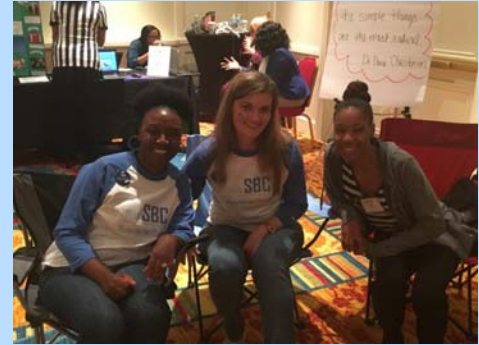
A few of the Practice Model Coaches at their Exhibit Table.