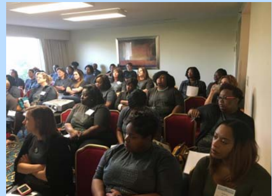
A group of Supervisors participating in one of the many workshops offered during the Summit.